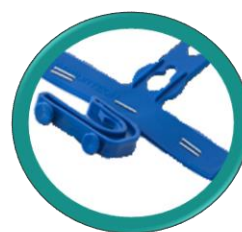
AbsorHook™ Blue Hook